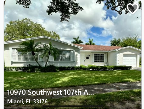
10970 Southwest 107th A... Miami, FL 33176