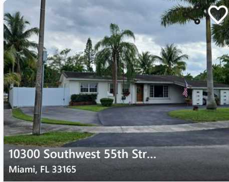
10300 Southwest 55th Str... Miami, FL 33165